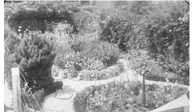
Aldgate Railway Station Garden 1914